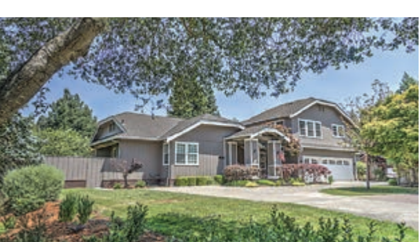
10 BRANDT DRIVE | MORAGA $1,750,000 5 BR | 3.5 BA | 3692 Sq. Ft. Elena Hood | CalBRE#01221247