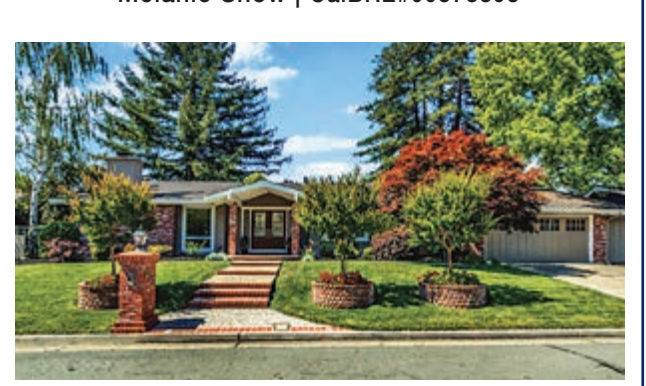
473 THARP DRIVE | MORAGA $1,425,000 4 BR | 3 BA | 2759 Sq. Ft. Lynn Molloy | CalBRE#01910108