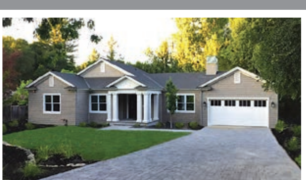
55 DONNA MARIA WAY | ORINDA $2,950,000 5 BR | 4.5 BA | 3907 Sq. Ft. The Beaubelle Group | CalBRE#00678426