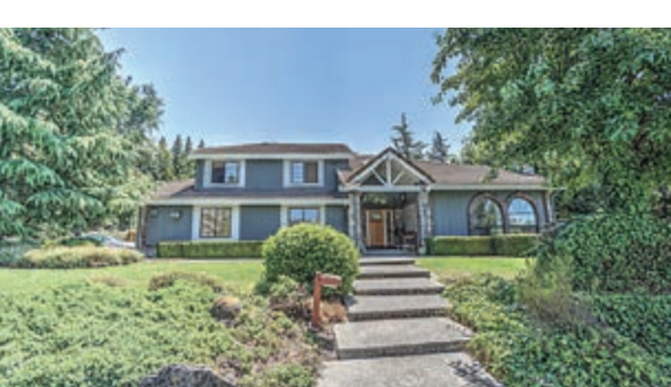
4 LAMP COURT | MORAGA $1,795,000 5 BR | 2.5 BA | 3092 Sq. Ft. Elena Hood | CalBRE#01221247