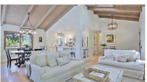
1005 KATHERINE LANE | LAFAYETTE $975,000 3 BR | 2 BA | 1371 Sq. Ft. Suzi O'Brien | CalBRE#01482496