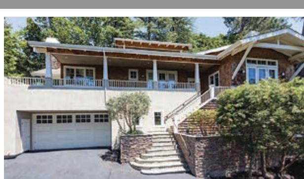
7 LA CINTILLA | ORINDA $2,795,000 4 BR | 4 BA | 4106 Sq. Ft. Melanie Snow | CalBRE#00878893