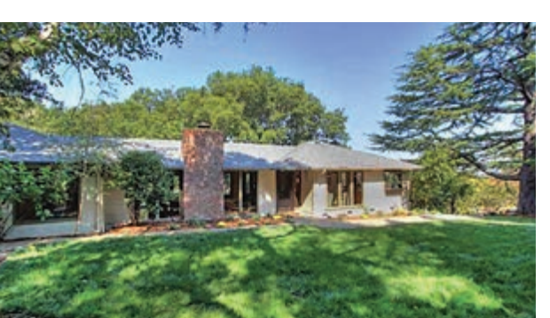
10 VISTA DEL ORINDA | ORINDA $1,350,000 4 BR | 2 BA | 2596 Sq. Ft. Laura Abrams | CalBRE#01272382