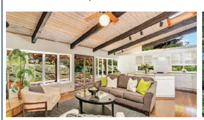
58 EVERGREEN DRIVE | ORINDA $1,375,000 4 BR | 2 BA | 2270 Sq. Ft. Diane Petek | CalBRE#01703677